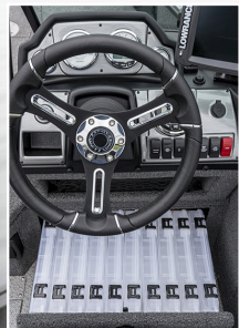
UNDER- CONSOLE TACKLE TRAY STORAGE